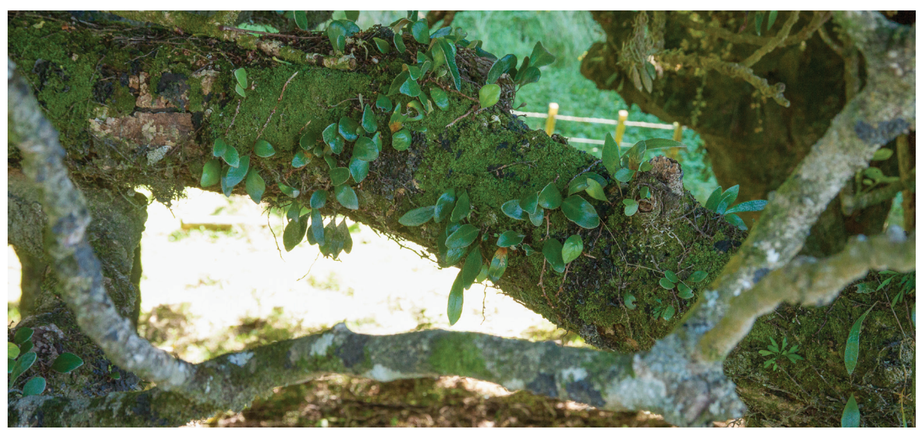
Ngahere, Native bush stands, Onenui Station, Tawapata South, Māhia, 2018

I think our farming now is based on being more as native plantings and waterway protection and environmentally sensitive than maybe they used to be in those days. I had uncles that made a living cutting down the environment and they were paid big money to do it. And now they're growing it back. Paying big money to do it. (Ben Mackey, 2018)