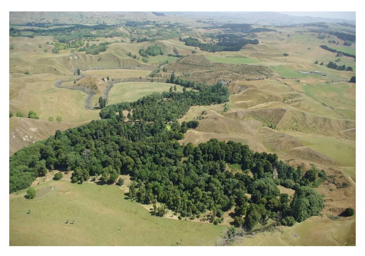
Figure 4. Drone image of Hawke's Bay forest remnant.

Drones also provide an excellent way to obtain aerial images of remnants and other biodiversity areas that are hard to photograph from the ground (Figure 4). With modern drones it is possible to program them so they take a photo from the same place and in the same direction each time, which greatly increases their value.