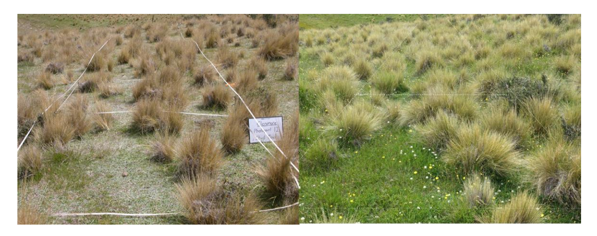
Figure 3. Close-up photo-point sequence showing little change in fescue tussock grassland over 13 years. Note tape lines (estimated in 2018) for reference.

There are some simple steps that can be taken to obtain a successful sequence of photos that allow interpretation of vegetation cover through time (Table 2).