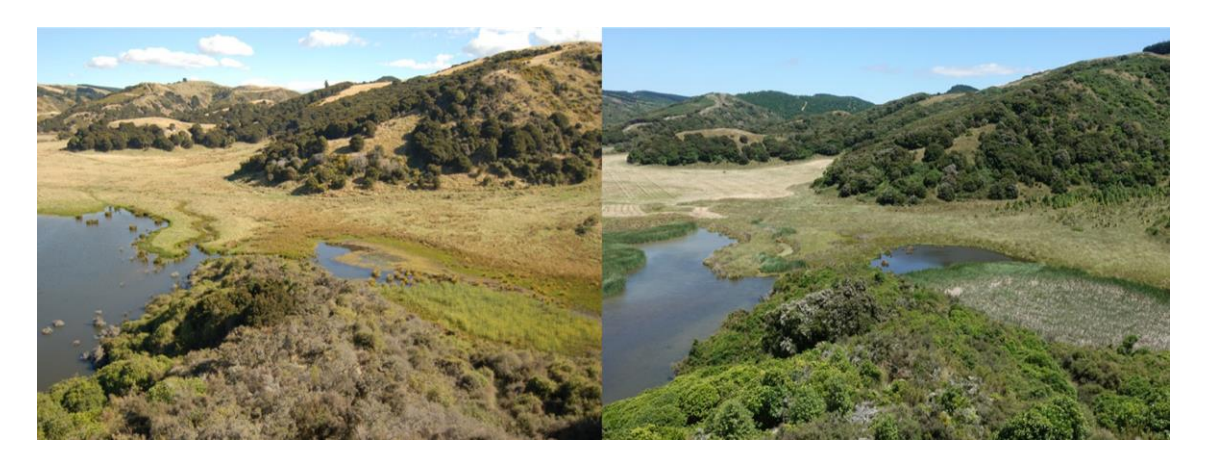
Figure 2. Landscape photo-point showing change in vegetation cover on a retired sheep and beef farm over 13 years (2005 left, 2018 right). Note the increase in shrub cover on the hillside in the top right and restoration plantings below this, and the changes to the two ponds, especially expansion of raupō in the left-hand pond. Māhoe is also now dominant in the vegetation on the spur in the foreground, where it was less important in 2005. The flats in the middle distance were cut for balage not long before the 2018 photo was taken.

Photo-points can be used to follow changes in both overall vegetation cover (landscape photo-points; Figure 2) and vegetation composition (close-up photo-points; Figure 3). The latter can be used to track changes in shrub or tussock density, or forest understorey condition. The strength of photo-points is that they are cheap and easy to do, and can be established and managed by the farmer. Depending on how they are set up and repeated, it is also possible to extract some quantitative information from them, at least for dominant species (e.g. by counting the number of tussocks or shrubs present).