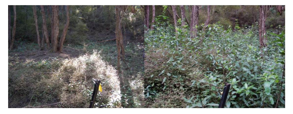
Figure 6. Close-up photo-point showing rapid re-growth of māhoe under a kānuka canopy over 3 years with grazing animal retirement. Note background trees for reference.

in their never being properly analysed. For landscape photo-points, several photos can be taken from the same place (a panorama; Figure 5). Depending on the size and nature of a property, the number of landscape photo-points is likely to range from 5–20 per property. The number of close-up photo-points will depend on the vegetation present and management issues that might apply on the farm. If the farm has some tussock grassland, then close-up photo-points are very good for tracking changes in tussock density. Close-up photo-points are also great in bush remnants or regenerating forest, such as kanuka, to track change in their understorey vegetation through time (Figure 6).