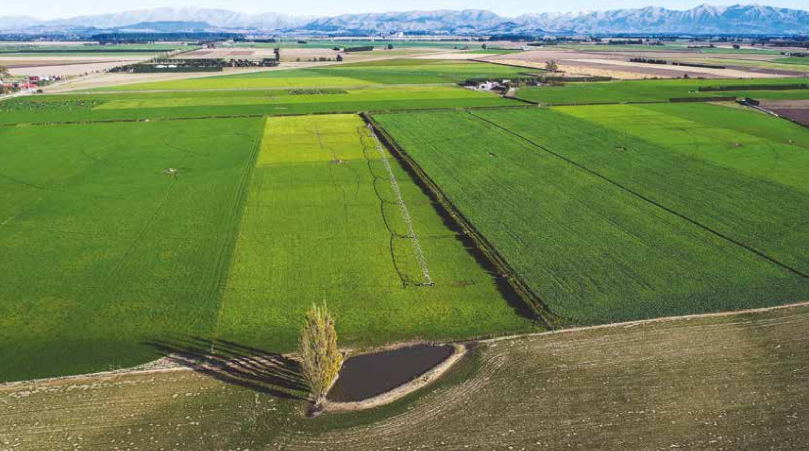
Drone-captured image of Canterbury farm